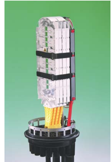
Mass Splice Tray

The UFC - Universal Fibre Joint is a high capacity enclosure primarily used for local distribution of optical cables / blown fibres in both aerial and underground optical fibre networks. The joint is circular in shape and offers high flexibility due to the cable entry options presented by the joint base. The single base configuration offers 28 round cable ports together with two oval ports for loop through applications. The joint cover is fitted with a pressure release valve and has its cap / base sealed with an "O" ring and clamp mechanism. Cable entries can be sealed using either mechanical cable entry kits (Cablelok™) and/or heatshrink sleeves on all ports.