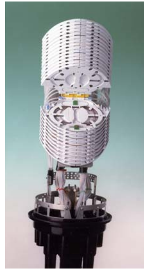
Ellipse SE-A Splice Tray