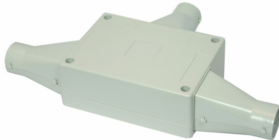
Internal TDU (Plastic Construction)

The Internal Tube Distribution Units (TDU's) are used as a 3 or 4 way distribution point for tube management for vertical / horizontal connections of blown fibre tube cables. The TDU's allow the interception of a Blown Fibre Cable to be connected to spur off cables for distribution within the internal environment.