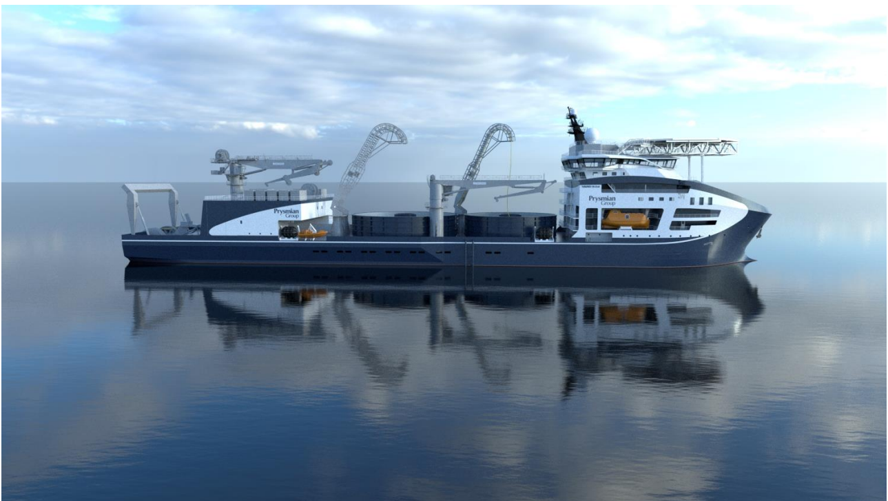
DP3 CABLE LAYING VESSEL