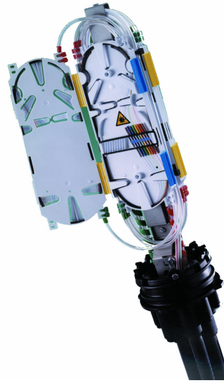
Using Medium Pon Splice Tray

The FRBU Mid Size Fibre Joint is primarily used for local distribution of optical cables / blown fibres in both aerial and underground optical fibre networks. The joint is circular in shape and compact. The base configuration offers 8 round cable ports together with one oval port for loop through applications. The joint cover is fitted with a pressure release valve and its cap / base is sealed with a rolling "O" ring and clamp mechanism. Cable entries can be sealed using either mechanical cable entry kits (Cablelok™) and/or heatshrink sleeves.