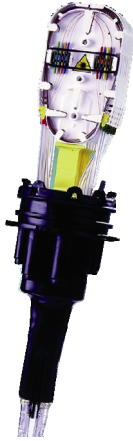
Using Small Pon Splice Tray